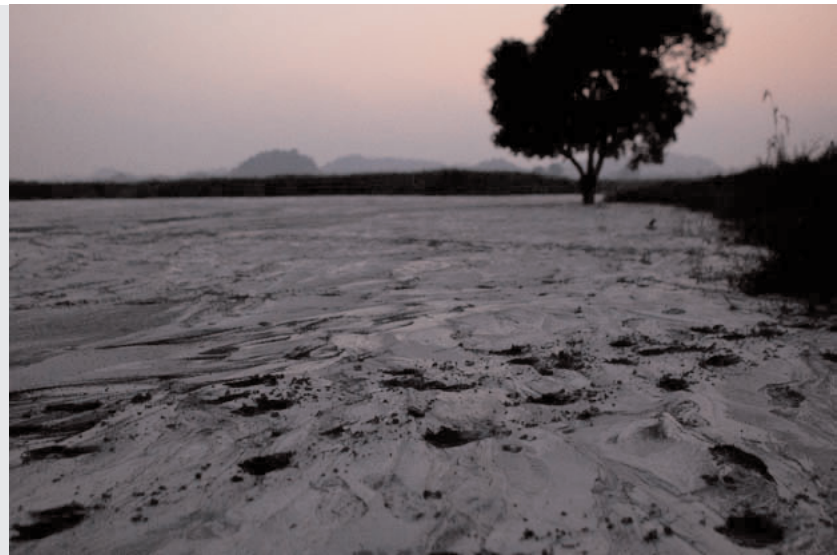
Hardened ash next to the reservoir in the Sonbhadra district of Uttar Pradesh.

The ash isn’t just a problem for Panika. When the ponds overflow, the ash ends up in the reservoir. Fishermen often wade in looking for their quarry, ignoring the pollution. On the day reporters spoke with Panika, a bare-chested man floated on a tire tube amid the ash, hoping to net fish.