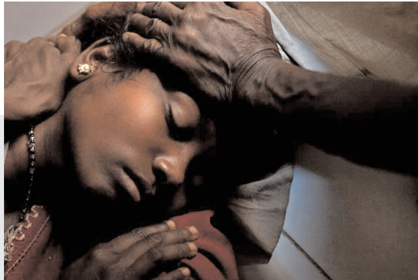
A woman complaining of muscle pains consistent with metal contamination waits in a hospital in the Sonbhadra district of Uttar Pradesh, India.

Most were tied to drinking polluted water, according to reports obtained by Bloomberg News in October. They stopped short of identifying the pollutants but independent scientists who have conducted exhaustive toxicology tests in the region say they know the