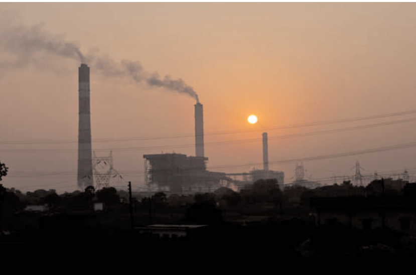
A factory in Anapara in the Sonbhadra district of Uttar Pradesh, India.

blood, hair and nails of people in the Singrauli region. Yet pollution continues to grow. United Nations data show India is second only to China in annual mercury emissions.