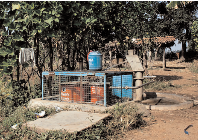
Water treatment in the Sonbhadra district of Uttar Pradesh.