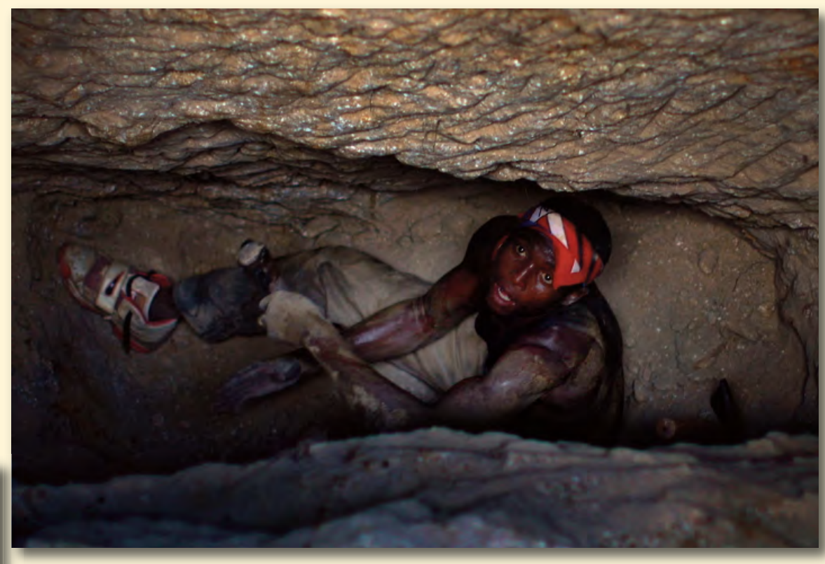
A man works in the narrow tunnel of an illegal gold mine just outside the tiny village of Dareta in northwestern Nigeria. The problem in this part of Nigeria is that the gold being extracted in artisanal mines is mingled with veins of lead. Compounding the problem, miners use primitive methods to process the raw ore.