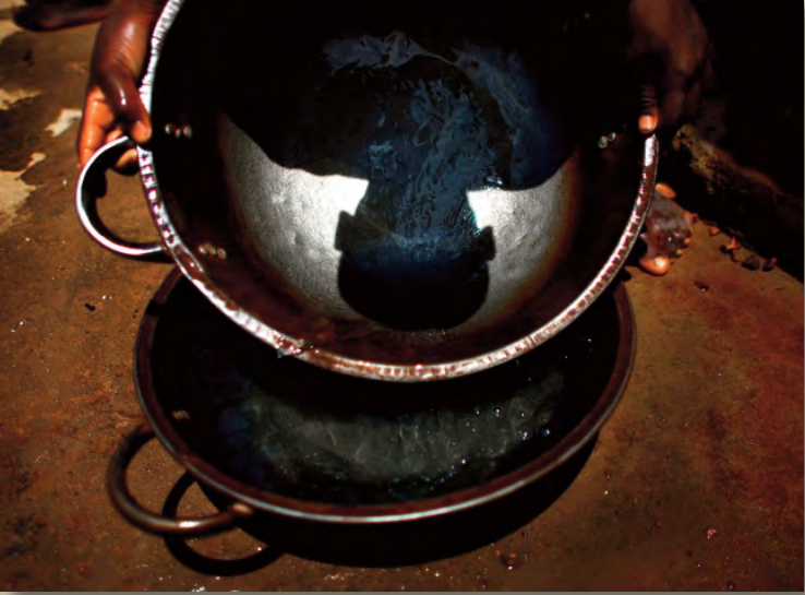
To extract gold from the raw ore, workers must first crush the ore, then wash and strain it through car floor mats. Finally the slurry is ground together by hand with a silvery glob of mercury in large metal wash basins, like the one used here at a gold processing site in Dareta, Nigeria.

"In Nigerian Gold Rush, Lead Poisons Thousands of Children"