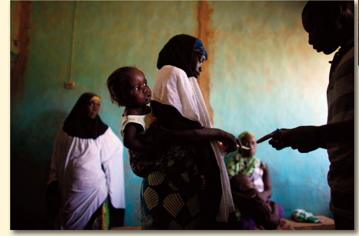
Women and their children wait for medication at the clinic in Dareta. Treating children with high levels of lead is a painstaking process that works only if their environment at home is free from lead.