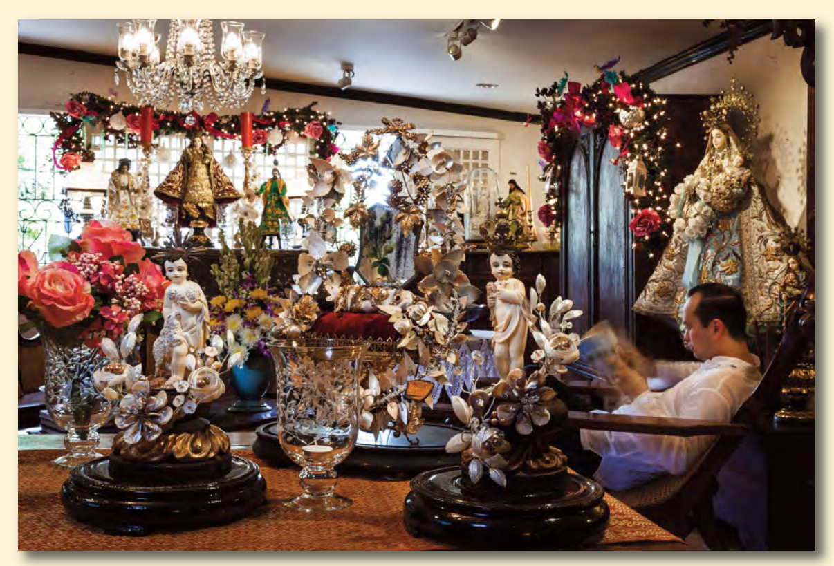
The home of a Filipino collector is lavish with ivory religious icons. "I don't see the elephant," says another Filipino collector. "I see the Lord." There is a collective of wealthy collectors in the Philippines who both search out and commission new work, thus sustaining a trade which allows for the continuing and growing market for new ivory.