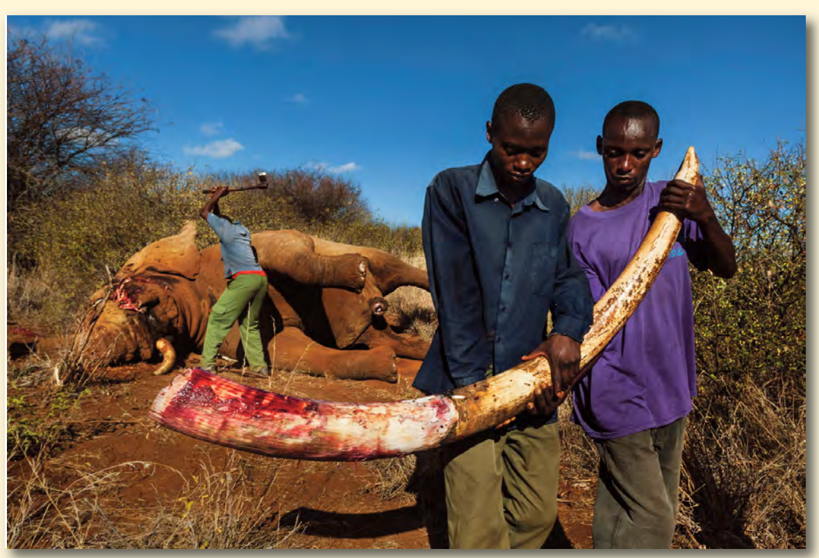
while, rangers killed 23 poachers.