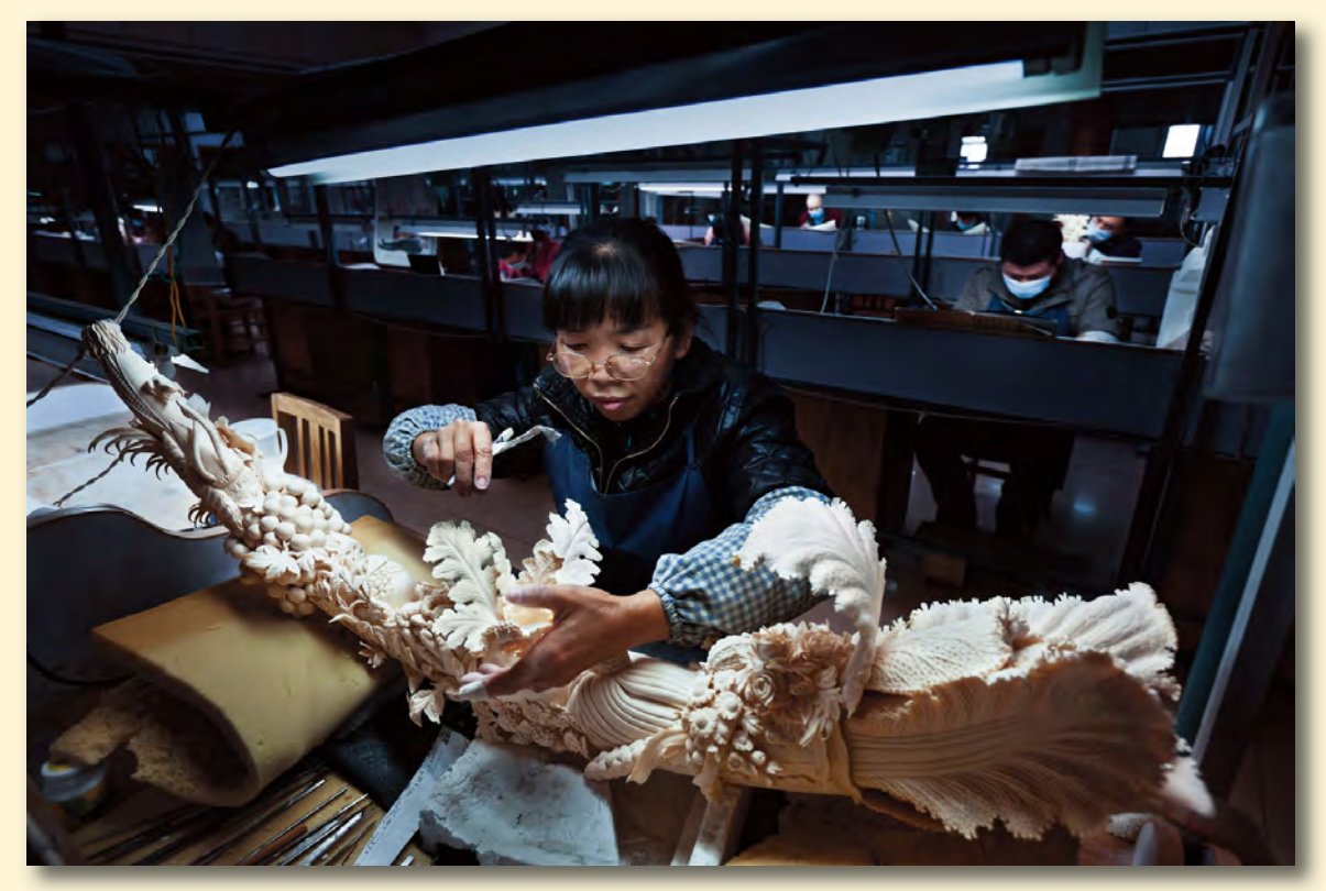
A worker in China's largest ivory-carving factory finishes a piece symbolizing prosperity. China legally bought 73 tons of ivory from Africa in 2008; since then, poaching and smuggling have both soared.