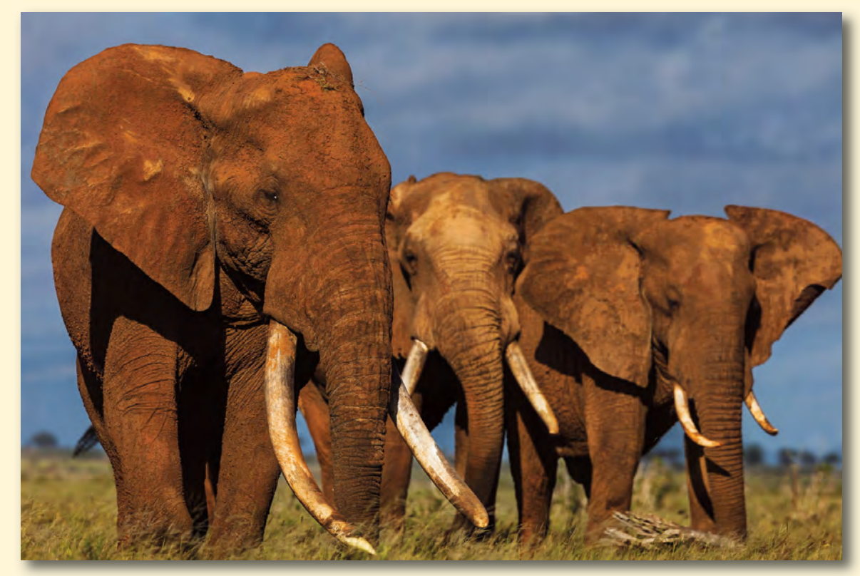
Some of the last big tuskers gather in Tsavo, Kenya. Massive elephant poaching in recent years has seen most of the mature bull elephant population of African countries decimated for their ivory. A single large tusk sold on the local black market can bring $6,000, enough to support an unskilled Kenyan worker for ten years.